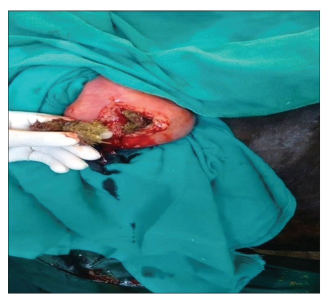
Figure-6: Photograph showing exteriorization of impacted cecum during right flank laparotomy.

episode of pain in few cases corroborates to the findings of Fubini et al. [8]. The longer duration of illness could be due to longer attempts of self-medication or symptomatic treatment by local veterinarians. Complete loss of defecation with or without passing mucus in majority of the animals corroborated with the findings of Braun et al. [5]. Pregnancy did not seem to be related with cecal dilatation and cecal impaction [7]. Reduced rumen motility in all the animals with cecal affection has also been reported by Braun et al. [2] who suggested that, sometimes, rumen contractions may persist with decreased amplitude during the disease. Ping sound was recorded at the caudodorsal half of the right paralumbar fossa on simultaneous auscultation and percussion in all the cases of cecal dilatation which corroborated with the