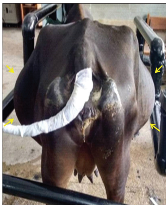
Figure-2: Photograph showing bilateral distension in cattle suffering from cecal dilatation.