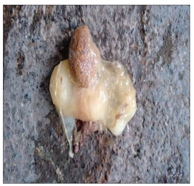
Figure-1: Photograph showing scanty mucoid feces.

Among the 11 bovines included in the present study, all were in the middle-age group and were female with a mean age of 5.72±0.53 years. Complete anorexia was recorded in majority of the animals (n=7, 63.63%), whereas reduced appetite was seen in the remaining four animals. Water intake was normal in majority of animals (n=9, 81.82%), whereas reduced water intake was seen in the remaining two animals. Pain was absent in most of the animals (n=7, n=7)63.63%), while a single episode of pain was observed in the remaining four animals. Duration of illness ranged from 4 to 10 days with a mean duration of 6.18±0.53 days in all the animals. Complete loss of defecation with or without passing mucus (Figure-1) was observed in majority of the animals (n=9, 81.82%), whereas scanty/mucoid feces were seen in the remaining two animals. Of 11 animals, three were non-pregnant, four were in early pregnancy (pregnancy <6 months), and four were in advanced pregnancy (pregnancy more than 6 months). Tympany was absent in majority of animals (n=8, 72.73%), while in three animals (n=3, 27.27%), tympany was reported by