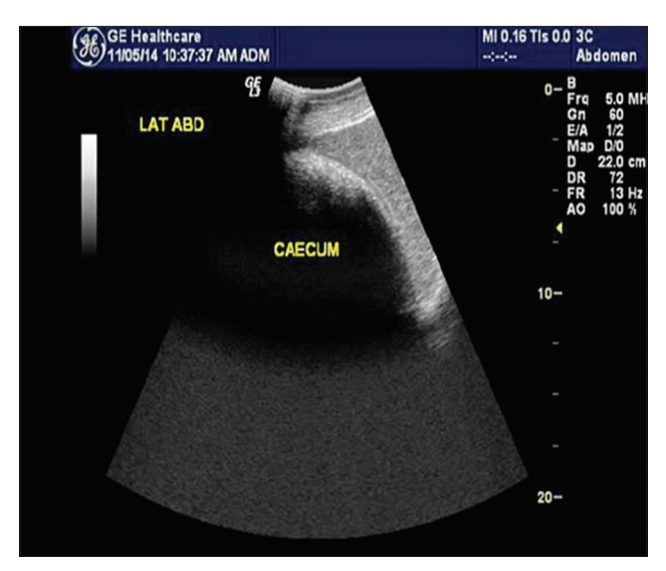
Figure-4: Ultrasonogram showing a distended semicircular structure with strong distal acoustic shadow on the lower right flank suggestive of cecal impaction.

episode of pain in few cases corroborates to the findings of Fubini et al. [8]. The longer duration of illness could be due to longer attempts of self-medication or symptomatic treatment by local veterinarians. Complete loss of defecation with or without passing mucus in majority of the animals corroborated with the findings of Braun et al. [5]. Pregnancy did not seem to be related with cecal dilatation and cecal impaction [7]. Reduced rumen motility in all the animals with cecal affection has also been reported by Braun et al. [2] who suggested that, sometimes, rumen contractions may persist with decreased amplitude during the disease. Ping sound was recorded at the caudodorsal half of the right paralumbar fossa on simultaneous auscultation and percussion in all the cases of cecal dilatation which corroborated with the