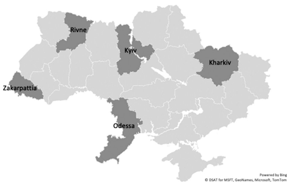
FIGURE 1 Map of Ukraine representing the study Oblasts where the Knowledge, Attitudes and Practice on ASF was conducted

Oblasts have the following geographic extension, Rivne with 20,100 km 2 (Kupets, 2012), Kharkiv with 31,400 km 2 (Ministry of Foreign Affairs of Ukraine, 2021), Odessa with 33,300 km 2 (Ministry of Foreign Affairs of Ukraine, 2021), Zakarpattia with 12,800 km 2 (Ministry of Foreign Affairs of Ukraine, 2021) and Kiev with 28,400 km 2 (Ministry of Foreign Affairs of Ukraine, 2021). Selected Oblasts had reported ASF outbreaks in both domestic pigs and wild boars during the period 2014–2019 (Figure 1), and were selected because these regions reported the highest density of ASF outbreaks in domestic pigs and ASF cases in wild boars in Ukraine from 2017 to 2018 (DTRA, 2018). The total number of ASF outbreaks in 2017–2018 was 31 in Odessa, 25 in Rivne, 21 in Kakarpattia and 14 in Kyiv (DTRA, 2018).