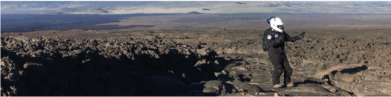
Fig. 1. Astronaut simulation, Female crew mission.

The PSI (Performance & Stress in Isolation) experiment aims to analyze stress levels during extreme missions without intrusive instruments. It has received the approval of the Ethics Committee of the Pope Giovanni XXIII Hospital in Bergamo on 11 August 2017. In this paper, the preliminary data collected from 29 participants (17 males and 12 females) to 6 space analogue missions (Figs. 1 and 2) accomplished among Europe, the USA and Israel in the 2016–2019 time frames, are presented. That is, as yet, the largest database ever analyzed of this kind.