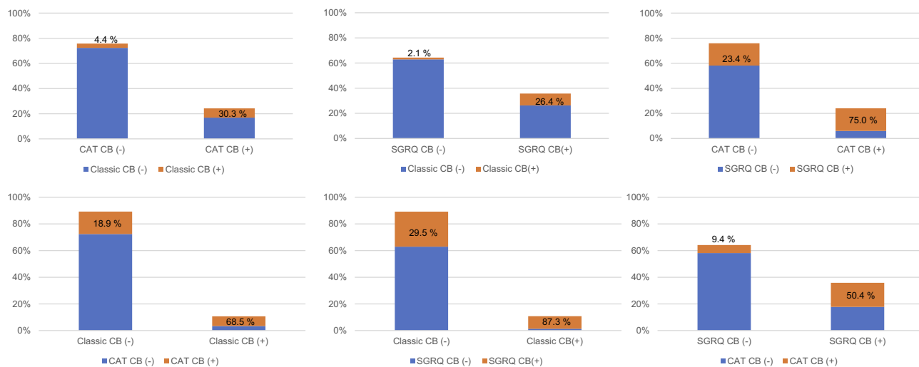
Figure 2 Discrepancies in patient groups among the three different definitions of CB. Abbreviations: CB, chronic bronchitis; SGRQ, St. George’s Respiratory Questionnaire; CAT, COPD Assessment Test.

The present study was performed to investigate two alternative definitions of CB, using SGRQ and CAT subscale scores pertaining to cough and sputum production, which could replace the classical definition. We compared the clinical parameters of CB and non-CB patients classified according to each definition, and the results showed that CB patients classified according to both alternative definitions showed similar results regarding clinical manifestations compared to those classified according to the classical definition. According to both of the new