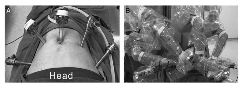
FIGURE 1. The installation method of the robotic system. Placement of trocars (A); installed robotic system for robotic gastrotomy with intracorporeal suture (B).

visualization (Fig. 2). The specimens, which were packed in specimen bags, were removed from the periumbilical or lower abdominal incisions. The placement of surgical incisions was showed in Figure 3.