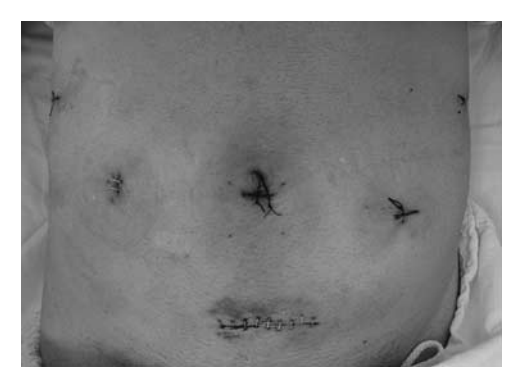
FIGURE 3. Placement of postoperative surgical incisions.

(Table 1). All cases underwent robotic gastrotomy with intracorporeal suture. No case was converted to open surgery. R0 resections were achieved in all patients. The mean postoperative length of stay was 3.3 (range, 2 to 5) days. No complications were reported within the hospital stay and 30 days after discharge from the hospital. Thus, nobody needed readmission.