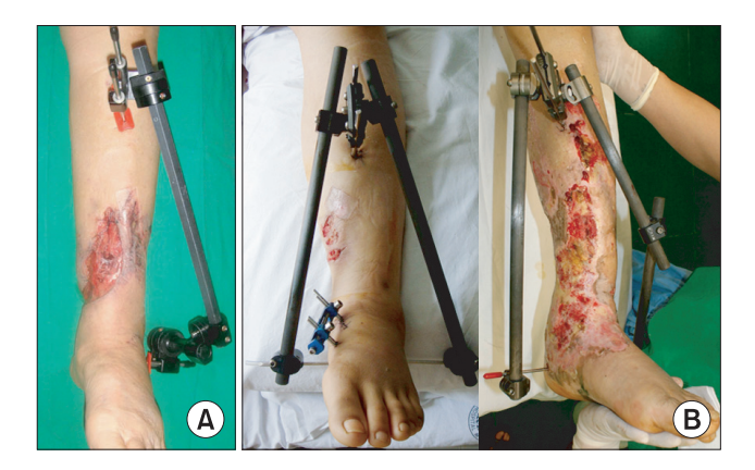
Fig. 1. (A) Mono frame. (B) Delta frame.

G-A: Gustilo-Anderson, AO/OTA: AO/Orthopaedic Trauma Association, TA: traffic accident.