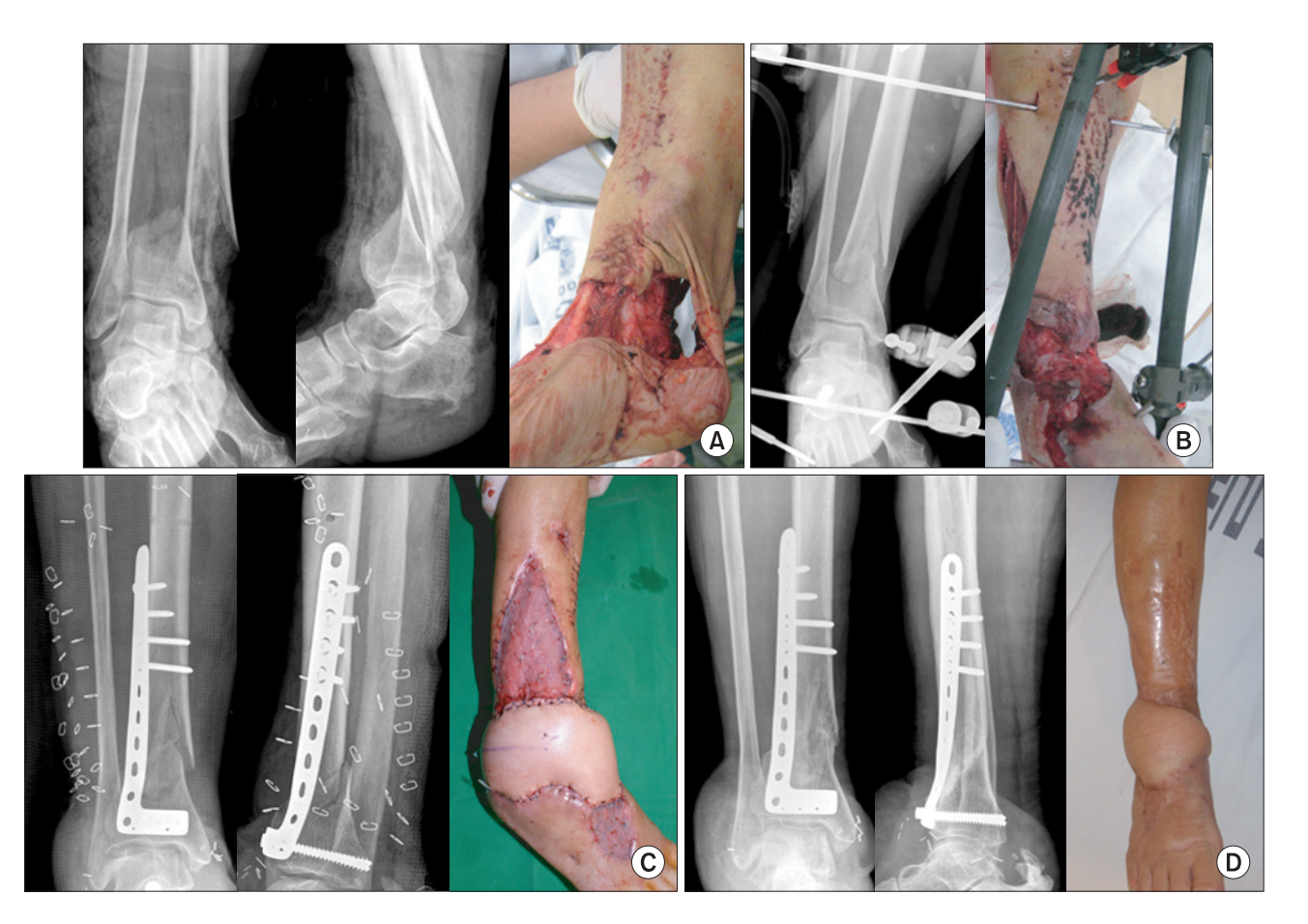
Fig. 3. (A) A 65-year-old woman sustained a right open distal tibia fracture (AO/OTA type A2, Gustilo-Anderson classification IIIB). (B) Stage 1, irrigation & debridement was performed and ankle-spanning bridge external fixator was applied. (C) Stage 2, after 6 weeks, lateral plate fixation of the distal tibia using the minimally invasive plate osteosynthesis (MIPO) technique was performed and anterolateral. rotator free flap and skin graft were applied. (D) The last follow-up, 13 months postoperatively. AO/OTA: AO/Orthopaedic Trauma Association.

days after surgery, we allowed a full range of movement of ankle joint. In patients who underwent treatment using a long-term joint spanning external fixator, continuous and adequate ROM exercises were performed. The majority of patients were encouraged to partially bear their weight, 5-7 weeks after operation. Patients were allowed to fully bear their weight when there was radiological evidence of bone union and no pain associated with the fracture site.