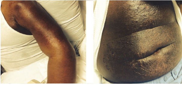
FIGURE 1: On physical exam, the patient was found to have a patchy, raised, nonulcerative healing rash with hypopigmentation on bilateral arms and forearms and anterior and lateral thighs, a patch of hyperpigmented rash on chest, and a diffuse rash over abdomen.

including ANA and dsDNA was negative. He was found to have an elevated total CK (1274 IU/L). ESR and CRP were normal. An upper endoscopy did not reveal any structural abnormalities.