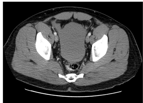
Figure 3 Axial, contrast-enhanced CT image of the pelvis demonstrates large hemoperitoneum.

splenic hematoma at the tip of the spleen tracking anteriorly with interim resolution of free fluid in the pelvis, confirming a splenic etiology for hemoperitoneum (Figure 4). Although the patient's CT scan did not show a blush suggestive of a pseudoaneurysm, the diagnosis