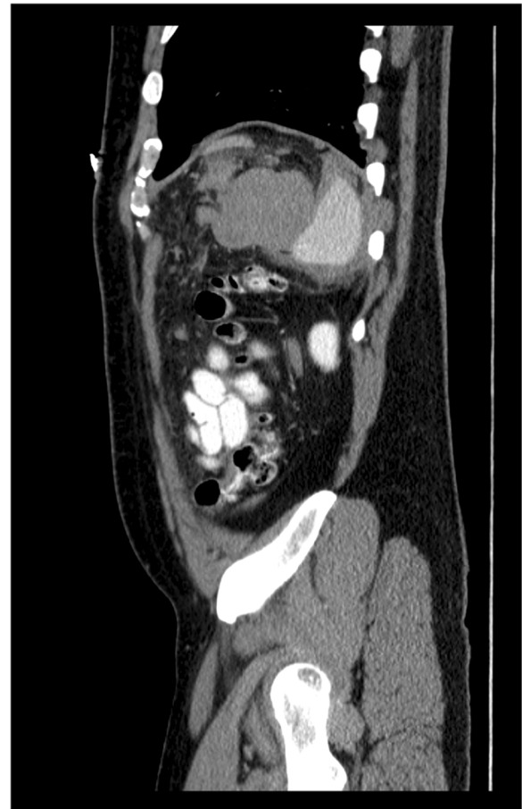
Figure 2 Sagittal, contrast-enhanced CT image demonstrates perisplenic hematoma.

splenic hematoma at the tip of the spleen tracking anteriorly with interim resolution of free fluid in the pelvis, confirming a splenic etiology for hemoperitoneum (Figure 4). Although the patient's CT scan did not show a blush suggestive of a pseudoaneurysm, the diagnosis