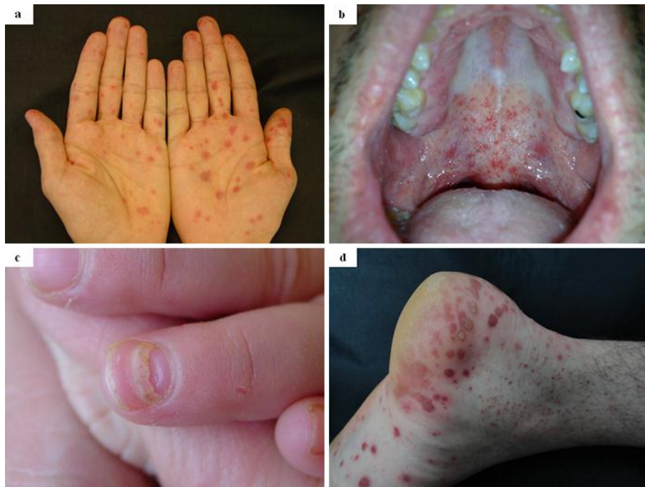
Fig. 1. a Family 1, case 1: erythematous, papular lesions of the palms mimicking erythema multiforme or secondary syphilis. b Family 1, case 1: papular enanthem of the oral cavity. c Family 1, the child: onychomadesis of a fingernail 2 months after Coxsackievirus A6 infection. d Family 2, case 3: erythematous, papulovesicular lesions of the right foot.