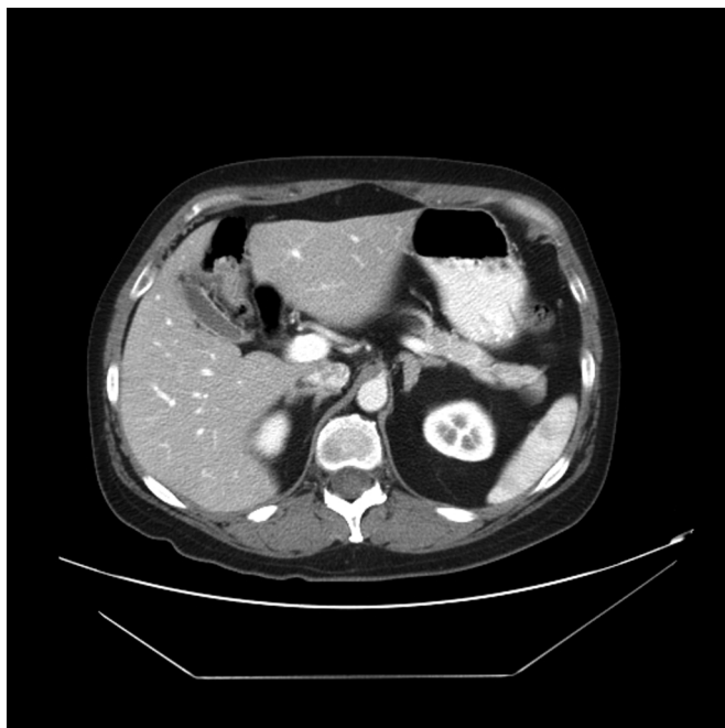
Figure 1. Computed tomographic scan of abdomen with contrast revealing bilateral adrenal hyperplasia. No masses or nodules seen.

undergo concurrent robotic-assisted bilateral adrenalectomy.