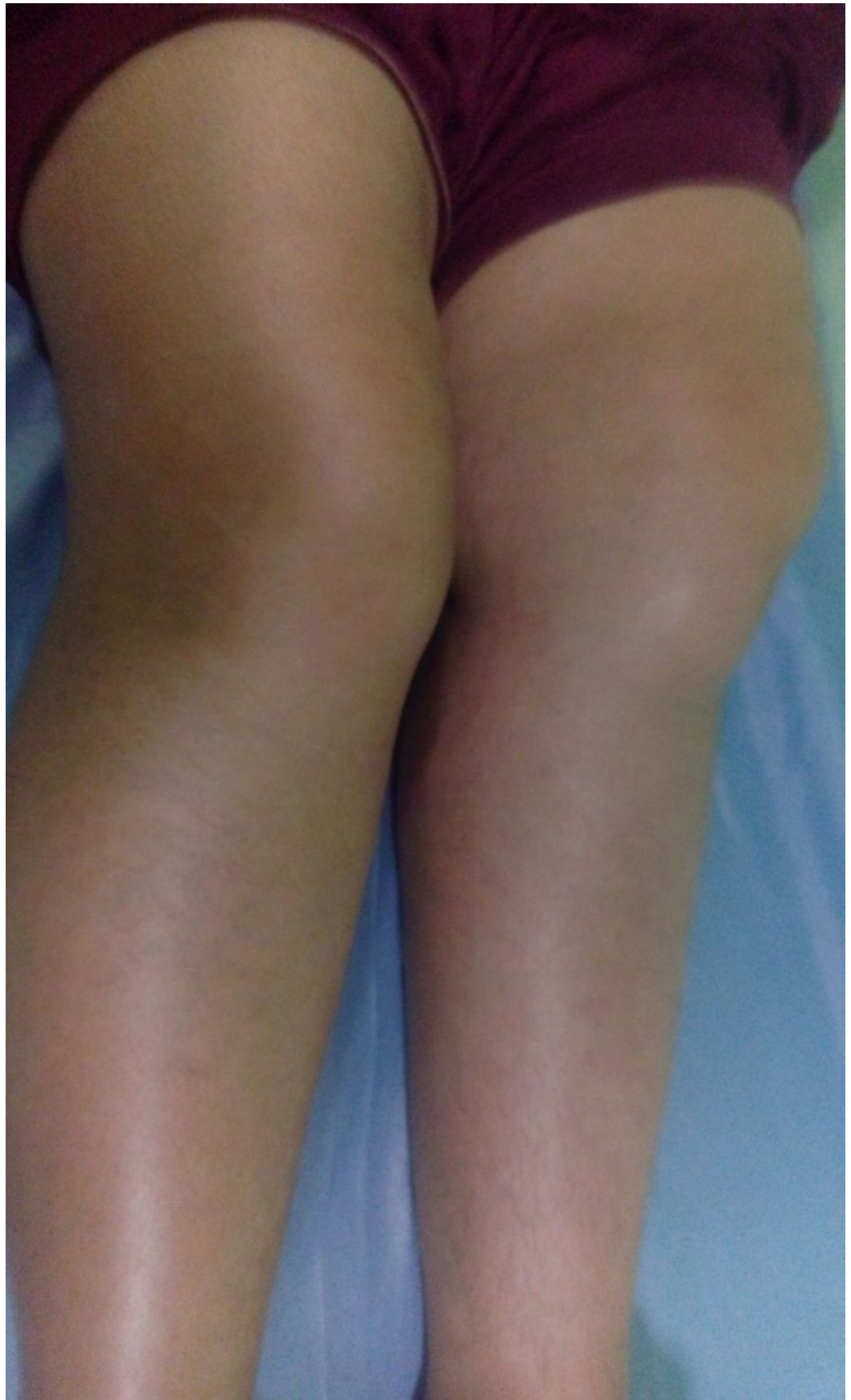
FIGURE 1: Clinical photograph of both lower limbs showing fixed flexion deformities