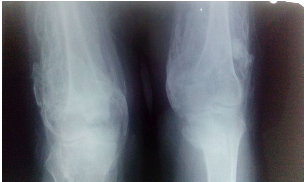
FIGURE 2: Anteroposterior radiograph of the knees showing diffuse heterotopic ossification

A hard bone mass was felt all around the knees with no involvement of the overlying skin. Plain radiographs revealed a diffuse heterotopic bone formation all around the knees (Figures 2-3).