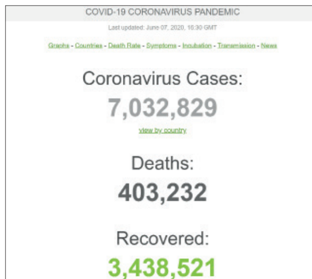
Figure 2. COVID-19 rates, Worldometer's report on June 6th, 2020

We do not currently have a specific and effective therapy against COVID-19. In addition, we do not have a single clinical study that would support prophylactic therapy that could affect COVID-19. All of the therapeutic options now available to us are based on the experience we have gained in treating SARS and MERS. When the vaccine is tested, we will be able to say that we have adequate methods and instruments in the battle