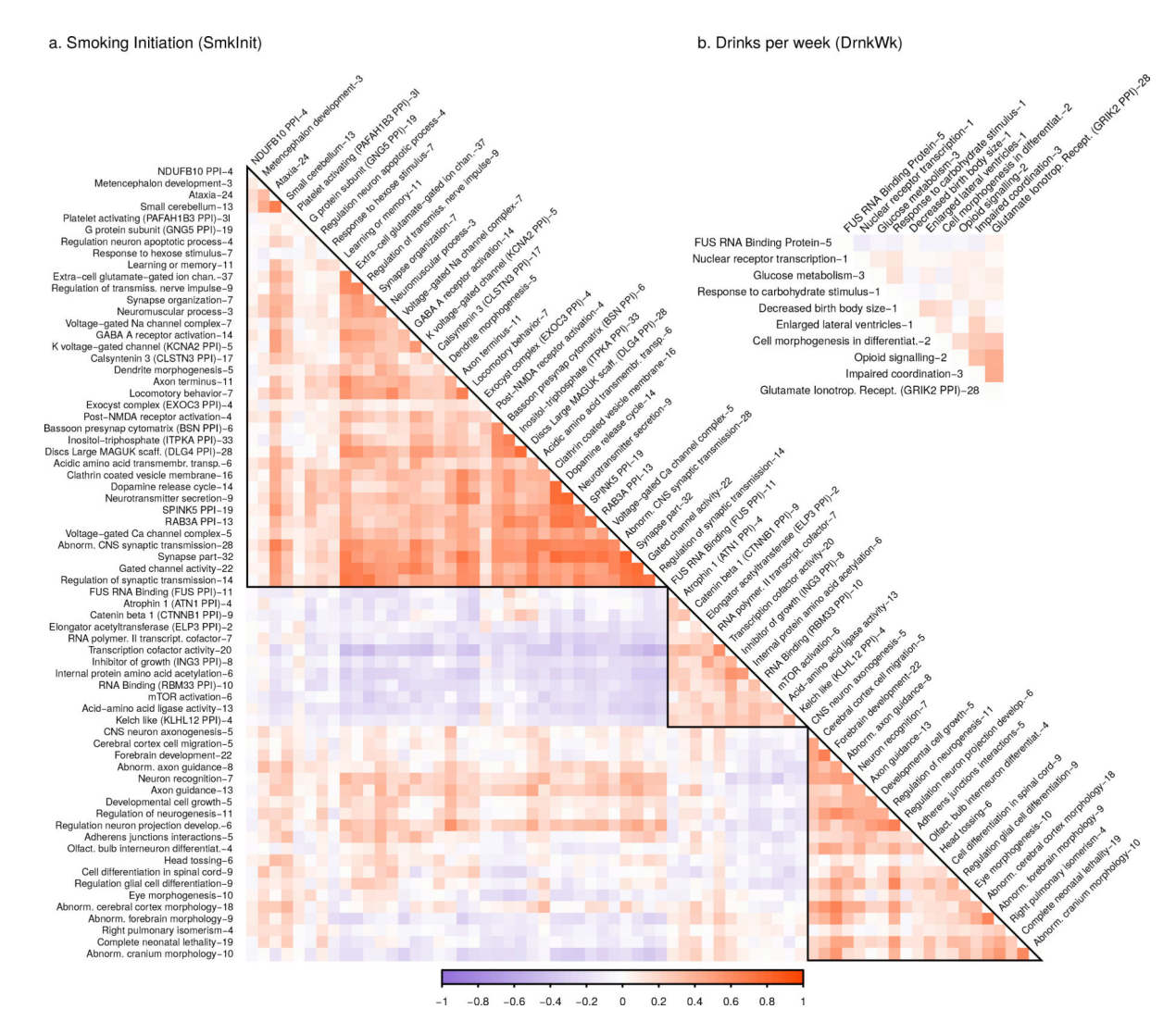
Figure 4. Correlations among exemplary DEPICT gene sets.

There were 68 clusters available for Smoking initiation and 10 for Drinks Per Week (CigDay, AgeSmk, and SmkCes did not have > 1 exemplary sets.) Blue shading represents positive correlations, and red shading represents negative correlations, with increasing color intensity reflecting increasing strength of a correlation. Cluster names are truncated for space, with a full list of all names in Supplementary Table 18. The number after each name is the number of gene sets in each cluster. The matrix naturally falls into three blue superclusters along the diagonal. The largest supercluster contains primarily gene sets related to neurotransmitter receptors, ion channels (sodium, potassium, calcium), learning/memory, and other aspects of CNS function. The middle supercluster includes gene sets defined by regulation of transcription and translation, including RNA binding and transcription factor activity. The final supercluster is composed primarily of gene sets related to development of the nervous system.