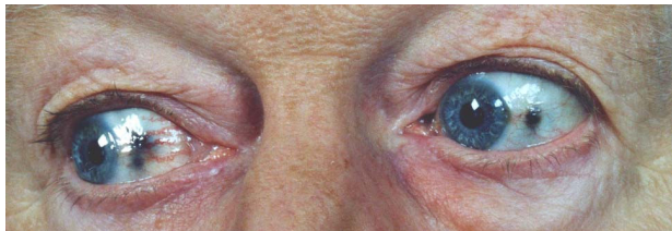
Figure 1 Ochronotic pigment on the sclera of the eyes of the patient.

An echocardiogram revealed that the patient's left atrium was normal in size while his left ventricle was slightly dilated (Figure 2). The pumping function of the left heart was normal - there was no evidence of hypertrophy - and the aortic valve had three cusps. A Doppler echocardiogram