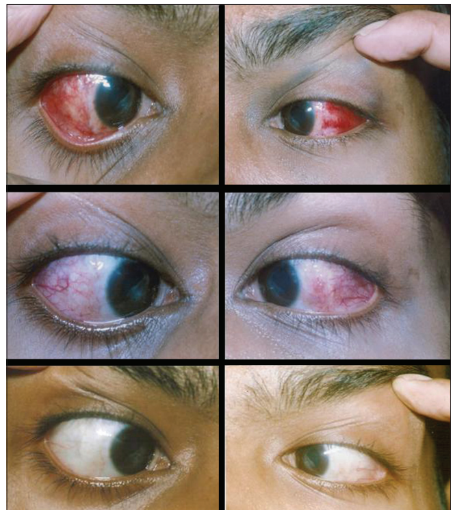
Figure 3: Postoperative follow-up of the same patient: RE: sutured, LE: glued. Top row – first day; middle row, at two weeks and bottom row at 4-6 weeks

We could access only one comparable human study in the