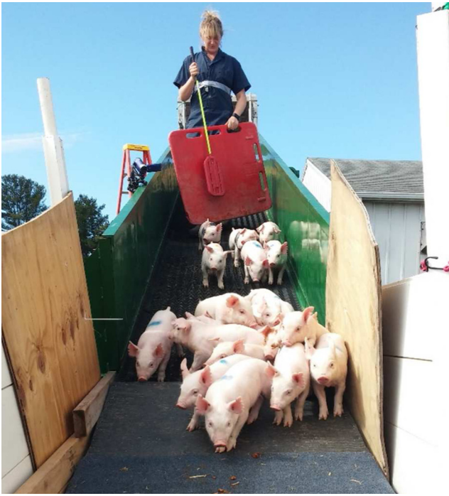
Figure 4. Pigs are being unloaded from the simulated trailer onto a small ramp that connects the conveyor to the ground.

(Sony, HDR-CX240 Handycam, Sony Corp. of Amer., New York City, NY; and Canon Vixia HFR700 camcorder, Canon USA Inc. Melville, NY)