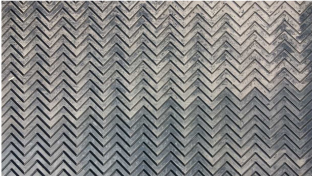
Figure 2. This figure displays the chevron pattern of flooring that comprised the belt of the conveyor. The rise of the texture was approximately 3.2 mm.

pigs up to an aluminum small livestock transporter, 2.3 m long \times 1.1 m wide \times 1.1 m high, bedded with straw. The surface of the conveyor was slightly textured with a chevron pattern approximately 3.2 mm in height (Fig. 2).