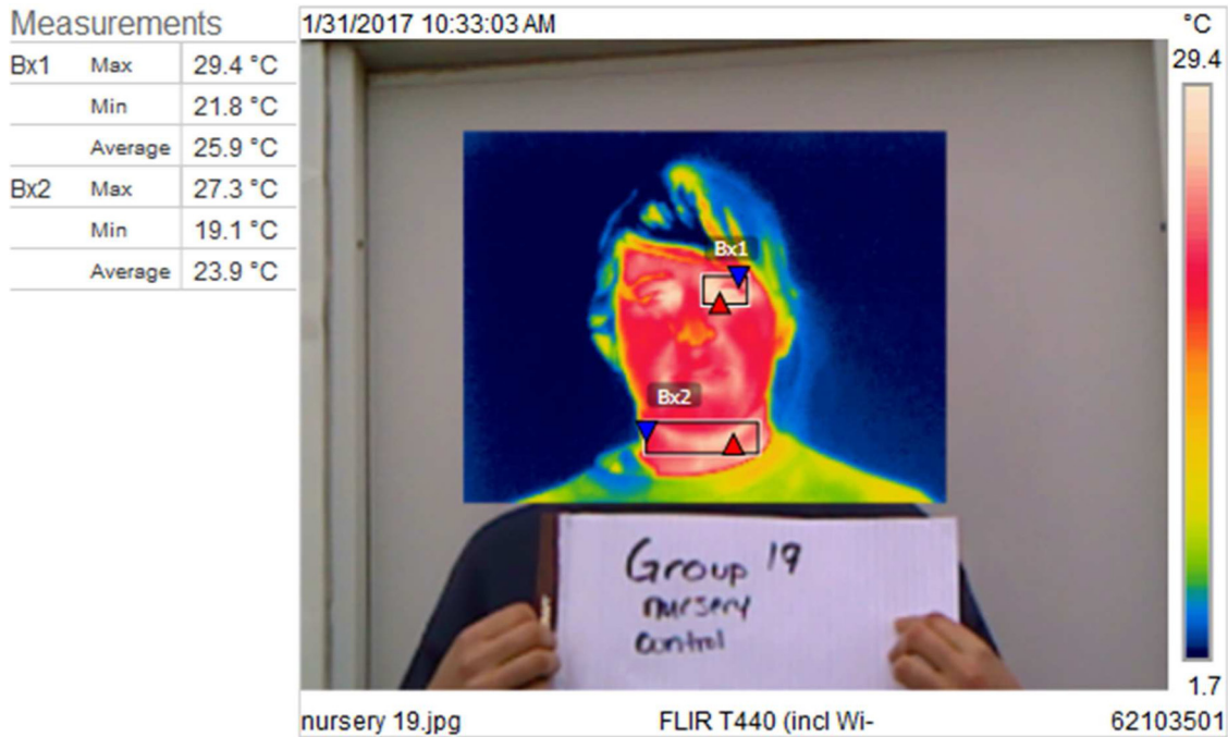
Figure 5. This thermal image is of the handler immediately after loading group 19, Nursery pigs. Body temperature of the handler was measured by drawing squares on the image around the eye and neck and recording the maximum temperature in each area. The scale on the right shows the range of temperature in the photo. The box on the top left provides the maximum, minimum and average temperatures.