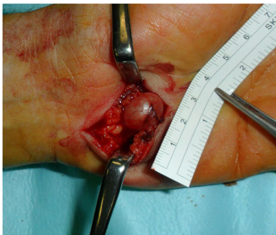
Figure 1: A curvilinear incision revealed an ulnar aneurysm 1.5 cm in length.