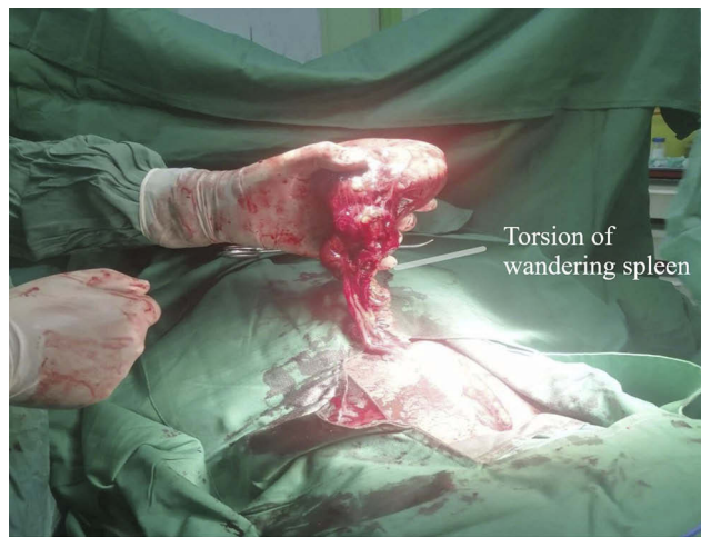
Figure 2 Photo taken during surgery, showing the position of the wandering spleen in the pelvic area.

are asymptomatic, and their ectopic spleen is diagnosed incidentally as an uncomplicated abdominal mass during a physical examination or imaging for other reasons. 7 The patient may experience mild intermittent abdominal pain due to congestion of the spleen as it twists and untwists intermittently, or show the symptoms of acute abdomen due to the torsion and infraction of the spleen vascular base. 3 Other clinical manifestations include nausea, vomiting, fever, leukocytosis, peritoneal stimulation signs, and a palpable pelvic or abdominal mass. The patient in the present study had a wandering spleen in the pelvic area attached to the omentum (with a blood supply from the omentum) with symptoms of severe pain in the abdomen, fever, nausea, vomiting, and lack of appetite.