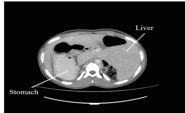
Figure 1 Abdominal CT scan. (A) Location of the cyst and the spleen in the pelvic area. (B) Location of the liver and stomach in the abdominal space.

appendix is located in the RLQ), and a large, thrombosed cystic mass attached to the omentum (with a blood supply from the omentum; normally, the splenic artery is responsible for the blood supply to the spleen), twisted around its axis (clockwise), was seen (Figure 2). The mass and the appendix were resected, and the pelvis and abdomen were washed. After achieving hemostasis, the abdomen was sutured and dressed. The lesion was sent to the pathology laboratory. The pathological findings reported both the spleen and cyst. After surgery, the patient was vaccinated and there were no infectious complications after splenectomy. The patient was discharged in good condition after two days.