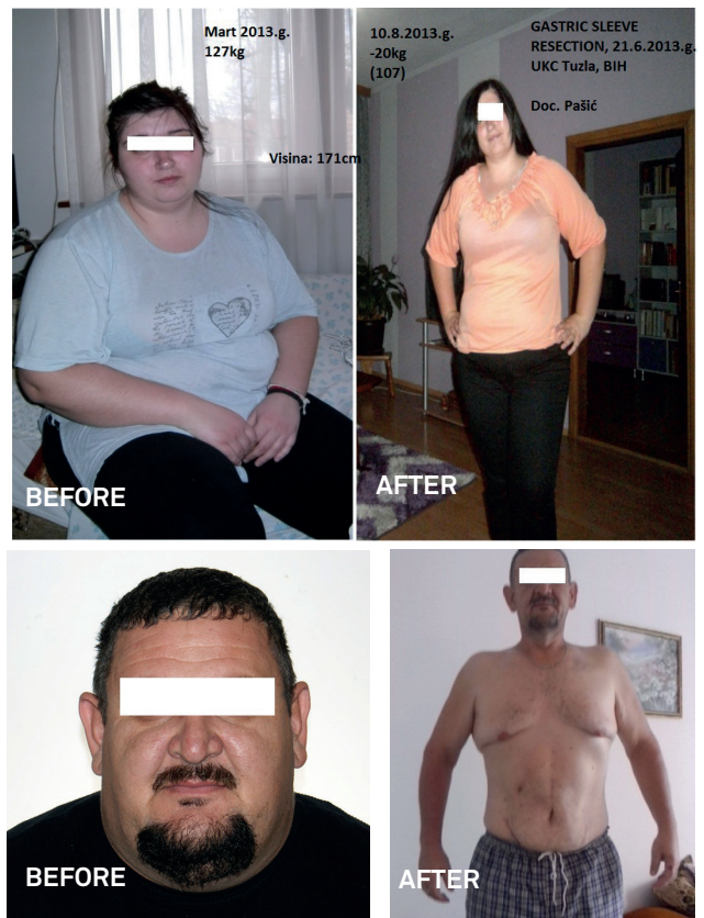
Figure 3. Patients before and after laparoscopic sleeve gastrectomy (3a) and biliopancreatic diversion (3b)

All 4 operational modalities (LAPGB, Sleeve resection of