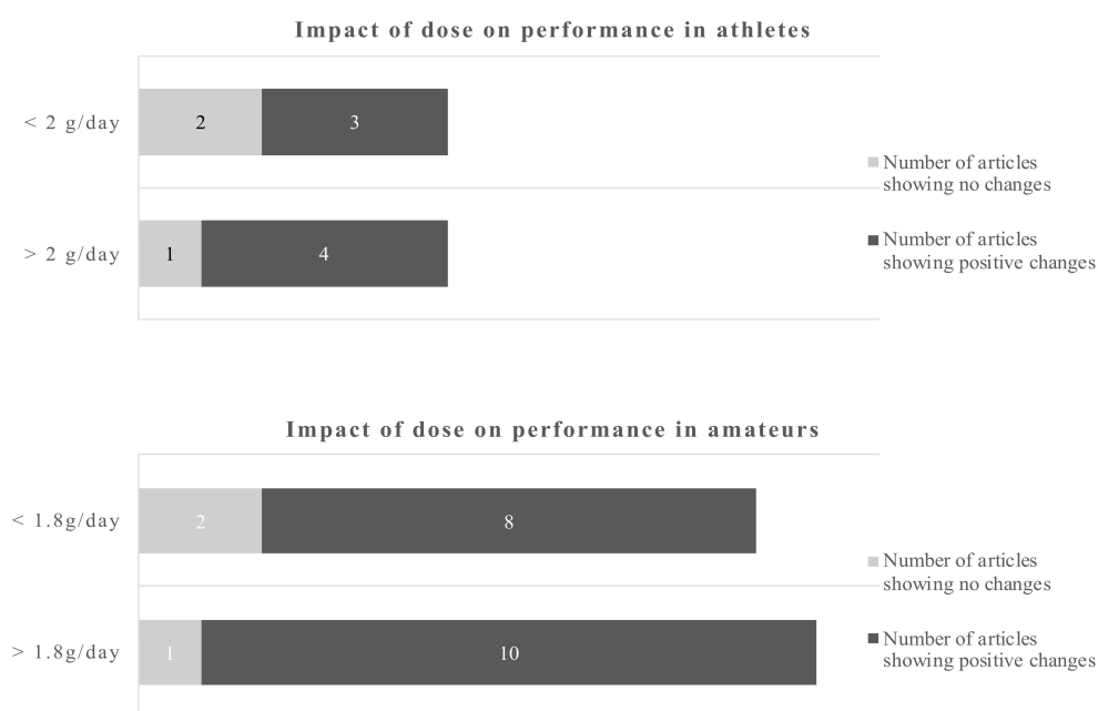
Figure 3. Impact of dose on recovery-related outcomes in athletes and amateurs by dichotomous split.

Using a dichotomous split for each, athletes and amateurs, the cut-off points were 5 weeks and 8 weeks respectively. For athletes, 4 out of 5 studies and 13 out of 14 studies in amateurs, favored the longer duration studies in terms of providing positive performance outcomes (Figure 3).