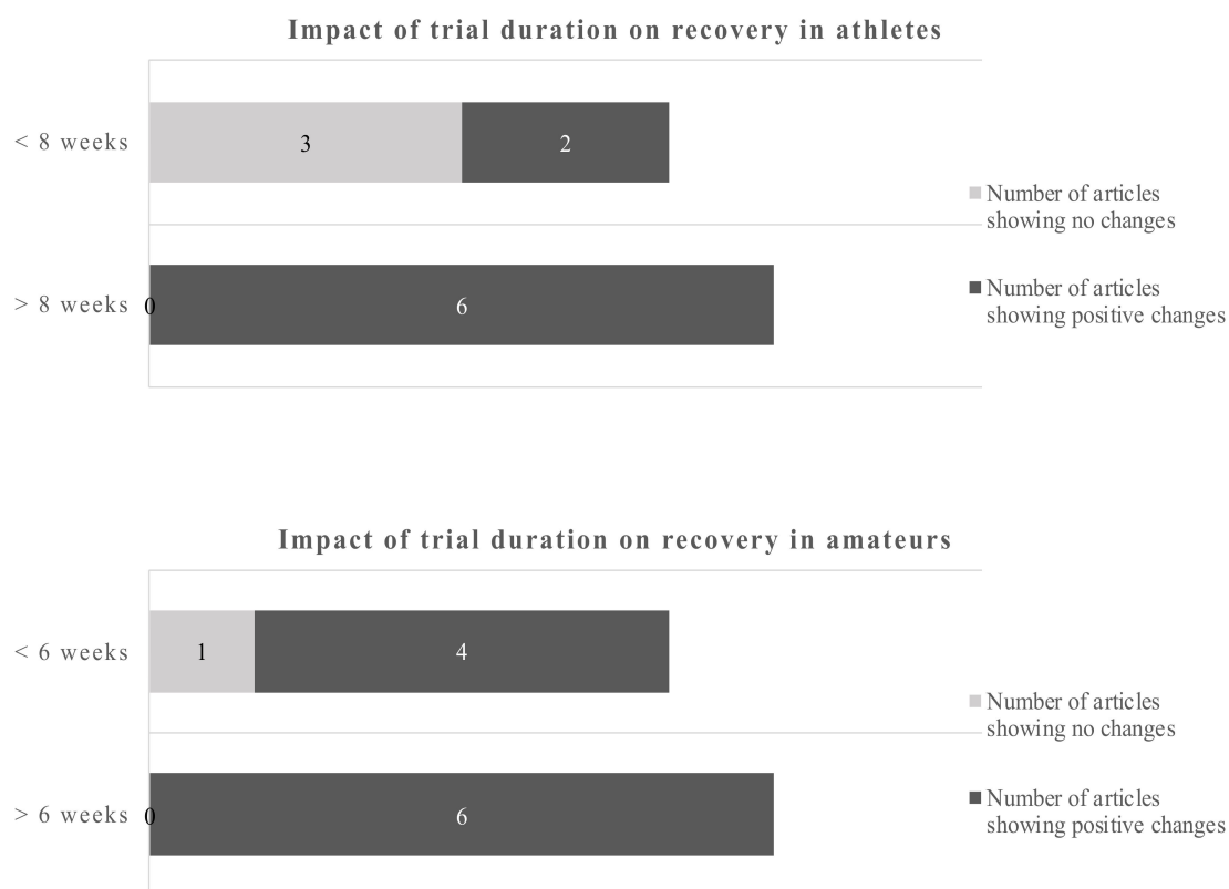
Figure 4. Impact of trial duration on recovery in athletes and amateurs by dichotomous split.

Using a cut-off of 8 weeks for athletes and 6 weeks for amateurs gives a dichotomous split. The evidence favors longer trials in athletes and amateurs.