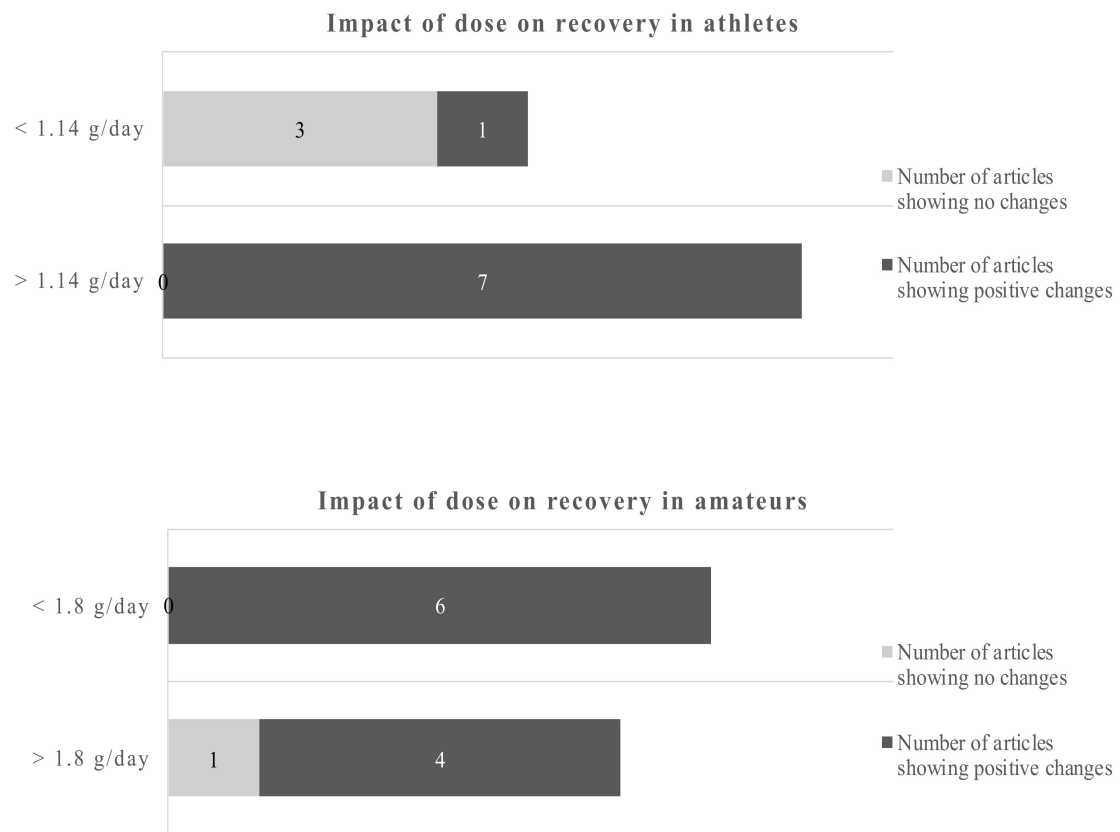
Figure 5. Impact of dose on recovery in athletes and amateurs by dichotomous split.

Using a cut-off of 1.14 g/day for athletes and 1.8 g/day for amateurs gives a dichotomous split. Overall, the data are clearer for amateurs. The evidence favors higher doses in athletes and amateurs.