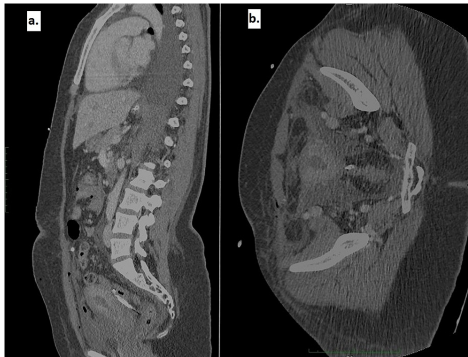
FIGURE 1: Computed tomography (CT) scan of the chest and abdomen-pelvis

CT showed heterogeneous uterine density and moderate diffuse endometrial thickening.