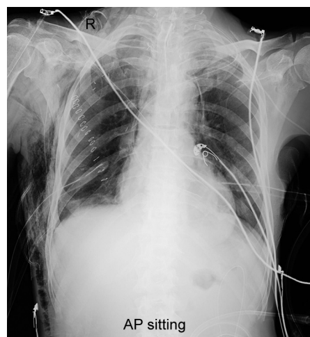
Fig. 1: X-ray chest anteroposterior view showing the presence of surgical emphysema following development of tracheopleural fistula