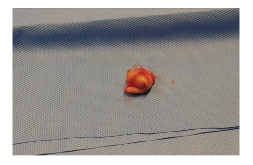
FIGURE 5: Umbilical nodule resected.

structures (the implantation or retrograde menstruation theory) [3]), haematogenous or lymphatic dissemination of endometrial cells (the dissemination theory), ectopic differentiation of pluripotent peritoneal progenitor cells to endometrial tissue (coelomic metaplasia theory) [3, 24, 25, 30], production of substances to form endometriosis by sloughed endometrium (the induction theory), specific stimulation to a Müllerian origin cell nest producing endometriosis (the embryonic rest theory), and proliferation of ectopic