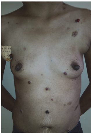
FIGURE 2: Disseminated multiples red brown papulonodules surrounded by satellite lesions on the trunk.