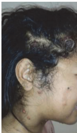
FIGURE 3: Ulcerated nodules on the scalp.

showed architectural disruption with polymorphic infiltrate composed of mainly foamy histiocytes and cytophagocytes; lymphoplasmacytes associated with neutrophils. Immunohistochemical stains showed S-100 and CD-68 positive histiocytes, but no staining for CD1a. The diagnosis of RDD was made. She received intravenous injection of methylprednisolone (2 mg/kg/d) for 3 days. On the third day of this treatment, she developed junctional tachycardia. Echocardiogram revealed septal hypertrophic with low LVEF 36% and noncompressive pericardial effusion, but no obvious nodules or masses were found. Because of circulatory collapse, electric cardioversion was required to restore sinus rhythm.