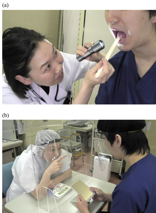
FIGURE 3 (a) Speech therapy session before the COVID-19 pandemic where personal protective equipment (PPE) was not required; and (b) speech therapy session during the pandemic where clinicians are required to use PPE when seeing clients [Colour figure can be viewed at wileyonlinelibrary.com ]

(310 of 2147) stopped outpatient therapy, 31% ( n = 668 ) provided limited face-to-face therapy, near 20% ( n = 418 ) continued face-to-face therapy without restrictions, 31% ( n = 668 ) did not provide outpatient therapy before the pandemic, and 4% ( n = 83 ) selected others but no further information was specified. For example, for Showa University Dental Hospital (with which one of the present authors is affiliated), which is located in the centre of Tokyo, all outpatient speech therapy was cancelled for 2 months, and face-to-face therapy resumed in June 2020. Before the COVID-19 pandemic, no PPE was used during clinical sessions (Figure 3a). However, since resuming face-to-face therapy in June 2020, a set of PPE including face shield, mouth shield, disposable gowns and caps are worn by clinicians to prevent virus transmission during speech therapy. Clients are asked to wear face shields, and an acrylic board is placed between the clinician and the patient (Figure 3b). The use of PPE and acrylic boards are essential in carrying out face-to-face speech therapy safely but there are some drawbacks (Corey et al., 2020; Hampton et al., 2020). Observing tongue movements through face shields and