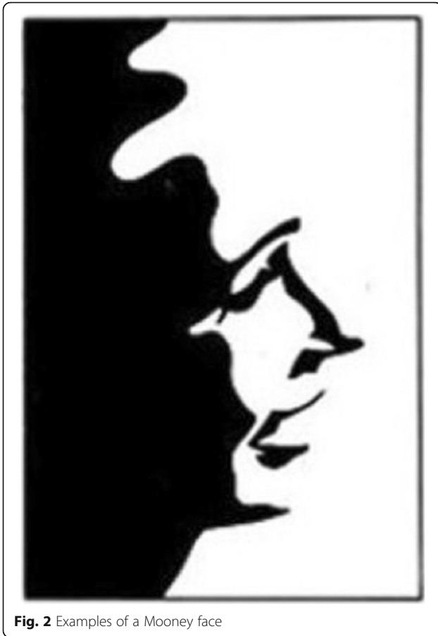
Fig. 2 Examples of a Mooney face

passage about 'France' and count the number of letter 'f's in the text. The aim was to create a parallel to the Face-detection Task that did not involve faces. The text passage was 300 words long and contained 50 'f's. Answers were scored in terms of the total number of letters correct. Participants were given 1 min to complete the task