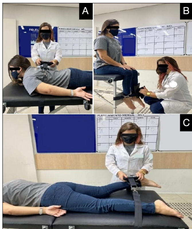
Figure 2. Evaluation with the dynamometer performed in the study. A) Measurement of strength for trunk extension movement; B) Measurement of strength of the knee extensors using the hand dynamometer with the support of a brace; C) Measurement of strength of the knee flexors using the hand dynamometer with the support of a brace.

Knee flexion: The patient stayed in ventral decubitus and, by using a belt, the dynamometer was fixed between the sural triceps and the calcaneus tendon (region posterior to the ankle). The participant was asked to bend the knee (amputees performed the test with the preserved side) to measure the strength of the knee flexor muscles (Figure 1C). 21 The patient was instructed to keep the hip supported on the stretcher to avoid any compensation of movement.