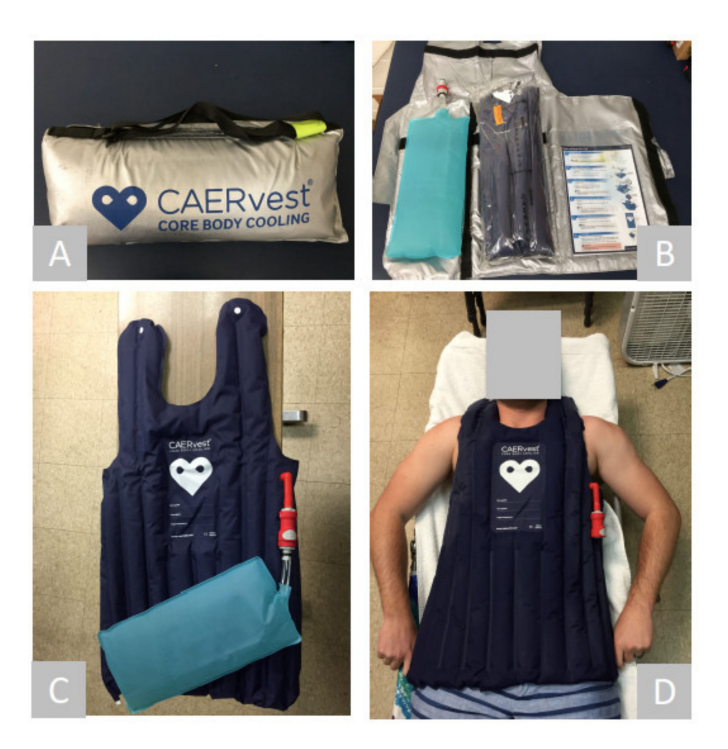
Figure 1. Overview of CAERvest<sup>®</sup> cooling vest. (A) Exterior packaging. (B) Contents of packaging. (C) CAERvest<sup>®</sup> being activated using a water reservoir attachment. (D) Participant being cooled.

Upon cessation of exercise, participants removed their T-shirt and shoes, and the cooling portion of the testing session began. The cooling intervention for both conditions took place within the climate-controlled chamber to replicate the scenario of pre-hospital care (i.e., providing the care onsite in the heat). In the VEST condition, participants laid supine on a cot, while CAERvest<sup>®</sup> was activated using an external water reservoir kept at room temperature (3000 mL), which triggers the chemicals inside the vest resulting in a cooled vest surface (Figure 1C). The dimension of vest was 730 mm by 820 mm, and covered the ventral side of torso from shoulder to hip (Figure 1D). After each trial, the vest was discarded. During the PASS condition, participants sat in a standard chair. Cooling in VEST and PASS conditions continued until T_{RE} reached 38.25 °C.