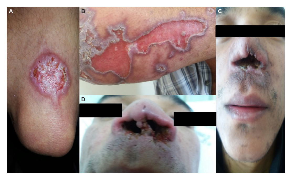
Figure 2 Lesions of tegumentary leishmaniasis. Note: (A) Typical cutaneous leishmaniasis, (B) Unusual manifestation of cutaneous leishmaniasis, characterized by large cutaneous ulceration, (C) and (D) Mucocutaneous leishmaniasis.

recognition and treatment are utmostly necessary. Most of the unusual clinical manifestations occur in patients with HIV with very low CD4+T-cell counts. These patients might also be affected with other opportunistic infections, making timely etiologic diagnosis challenging.<sup>40</sup>