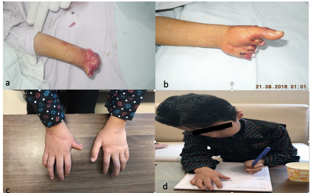
FIGURE 2: 2a and 2b showing bilateral transmetacarpal amputation in a six-year-old boy due to a grass-cutting machine. 2c showing the replanted hands after tenolysis and nerve repair. 2d showing good function achieved after secondary procedures.

injuries, the mean difference was also statistically significant: 45.5 preoperation and 33.7 postoperation (CI 9.89-13.70, p < 0.01 ). For wrist injuries, the QuickDASH mean score was 52.8 preoperation and 46.3 postoperation (CI 1.81-6.58, p = 0.0023 ). The QuickDASH scores of patients with arm and forearm injuries showed no statistically significant improvement, with a decline from 58.3 to 55.2 ( p = 0.98 ). The overall replantation and revascularization scores pre and postoperation were 49.725 and 41.175, respectively (CI 8.35-8.75, p < 0.01 ). Overall, the results indicated improvement in the QuickDASH scores after secondary procedures on replantation and revascularization patients. The QuickDASH score improvement was more pronounced for distal injuries than more proximal injuries (Figure 2).