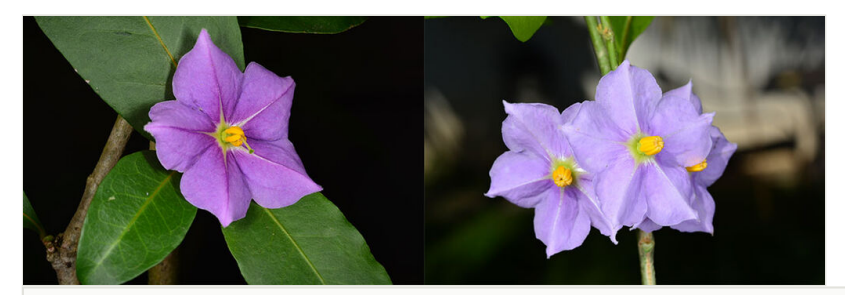
Figure 3. doi Long-styled (left) and short-styled flowers (right) of Solanum conocarpum .

ripe (Fig. 4) (Acevedo-Rodriguez 1996, U.S. Fish and Wildlife Service 2019, PBI Solanum Project 2020). Solanum conocarpum occurs in dry deciduous and coastal forests with a varied range of associated woody species that lack a characteristic species composition. The species usually grows as an understorey plant responding favourably to disturbance (Stanford et al. 2013, Lindsay et al. 2015, Heller et al. 2018). A habitat suitability model for this species, for the island of St. John, identified 695 hectares of high-quality habitat, 1,275 hectares of moderate-quality habitat, 2,912 hectares of low-quality and poor-quality habitat and 187 hectares of unsuitable habitat (Palumbo et al. 2016). Some of these areas have already been surveyed but a full validation of this model is needed (Monsegur, pers. obs. 2021).