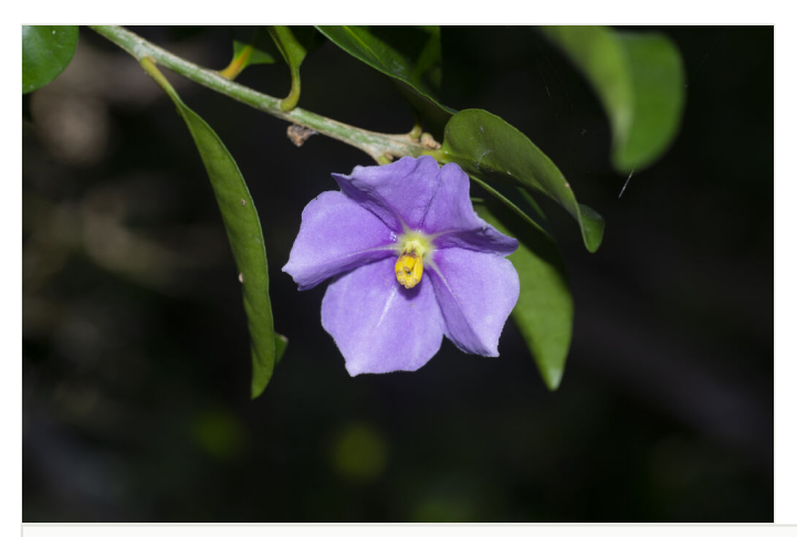
Figure 1. doi Flower of Solanum conocarpum on recently discovered plants on the island of Tortola, BVI.

Islands) and St. John (US Virgin Islands) are separated by less than 2 km of water at their nearest points.