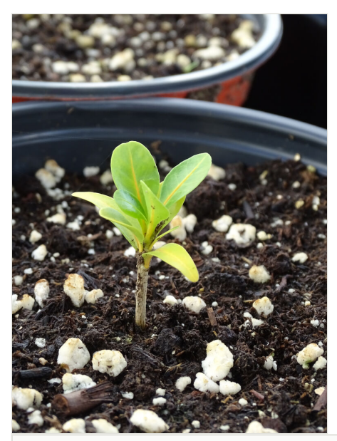
Figure 6. doi Recently propagated sapling of Solanum conocarpum grown from the seeds wild-collected at the J.R. O'Neal Botanic Gardens on Tortola, BVI.