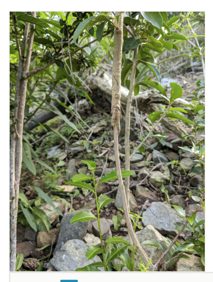
Figure 8. doi Solanum conocarpum stem damaged by feral animal grazing.