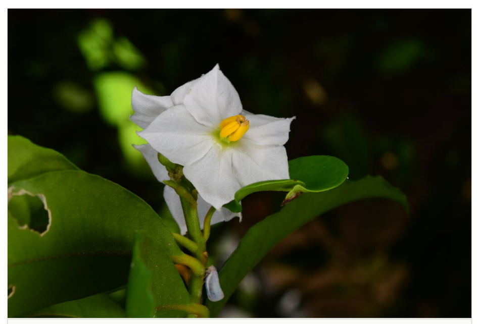
Figure 7. doi Ex situ collection of Solanum conocarpum displaying a white flower.