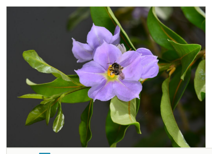
Figure 5. doi

Regarding possible pollinators for this species, there are reports of Xylocopa mordax Smith, 1874 and Apis mellifera Linnaeus, 1758 actively visiting the flowers. These observations were followed by a massive fruit production event, suggesting these insects may be effective pollinators for S. conocarpum . Seed disperser vectors for this species remain unknown (U.S. Fish and Wildlife Service 2017, U.S. Fish and Wildlife Service 2019). Recently, Exomalopsis bahamica Timberlake, 1980, a native Caribbean bee, has been observed visiting cultivated material on Puerto Rico (Fig. 5) (Monsegur, pers. obs. 2021). Further research is needed to determine the reproductive biology and confirm the field observations.