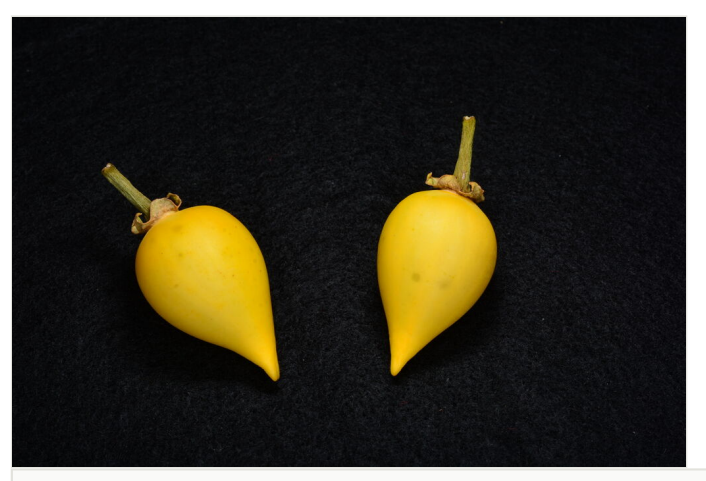
Figure 4. doi Ripe yellow fruit of Solanum conocarpum .

Previous studies by Stanford et al. (2013) suggested that individuals of this species are self-incompatible, possiby due to stigmatic differences between flowers, rather than genetic-based self-incompatibility. However, recent observations of isolated, cultivated material have shown certain individuals to be self-compatible, producing copious fruits,