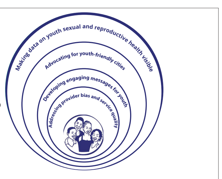
FIGURE 2 | TCI's concentric circle strategy for AYSRH programming.

Service delivery: Improving the quality of contraceptive care for young people by increasing youth-friendly service delivery sites with unbiased, supportive health providers.