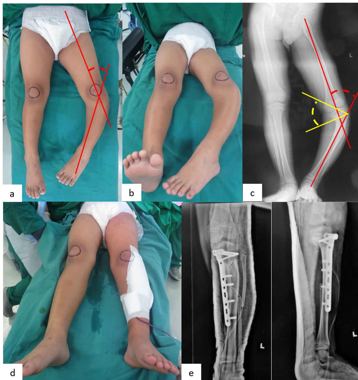
Fig. 1. Pre and post operative results. (a) Pre operative clinical picture. Tibiofemoral lines from clinical picture was 46^\circ , (b) Pre-operative clinical picture. Birds view, (c) Pre-operative Xray. Red lines – TFA 46^\circ , Yellow lines – Drennan angle 43^\circ , (d) Post operative clinical picture. Tibiofemoral lines from clinical picture was 10^\circ , (e) Postoperative birds view with the deformity already corrected, (f) Postoperative TFA was 10^\circ , Drennan angle was 4.3^\circ , and from lateral xray procurvatum was corrected.

Poor patient compliance may lead to premature consolidation of osteotomy and correction failure. In addition, the maintenance of pin sites that are less than ideal by the patient's parents in Indonesia can increase the risk of infection. Therefore, an acute correction strategy needs to be further studied to be applied for Blount's disease patients in Indonesia. In other hand, several techniques reconstruction had been described, but easier, safer and more precise technique still demanded to be utilized for acute correction.