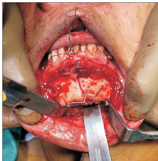
Fig. 2. Image depicting the ATOM technique (Anatomic reduction using screw-wire Traction for Open reduction and internal fixation of Mandibular fractures).

Pranav D. Ingole et al: ATOM technique: Anatomic reduction using screw-wire Traction for Open reduction and internal fixation of Mandibular fractures. J Korean Assoc Oral Maxillofac Surg 2022