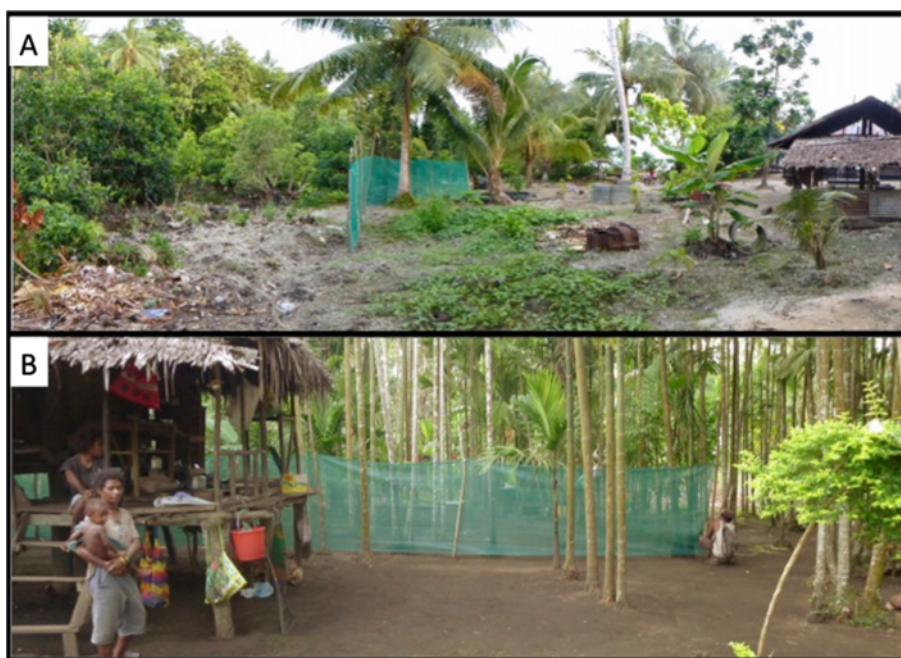
Figure 2 Barrier screens were constructed between village houses and potential resting and/or oviposition sites, as shown in Haleta village, Solomon Islands (A) and Mirap village, Papua New Guinea (B). Potential resting sites among the vegetation and the primary oviposition site (a brackish water swamp) can be seen to the right of the barrier screen while village houses and animal pens (seen to the left of the barrier screen) provide potential blood meals.

collected from the barrier screen for 14 consecutive nights in November 2011.