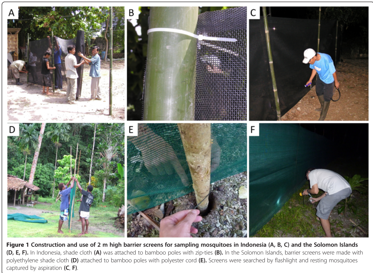
Figure 1 Construction and use of 2 m high barrier screens for sampling mosquitoes in Indonesia (A, B, C) and the Solomon Islands (D, E, F). In Indonesia, shade cloth (A) was attached to bamboo poles with zip-ties (B). In the Solomon Islands, barrier screens were made with polyethylene shade cloth (D) attached to bamboo poles with polyester cord (E). Screens were searched by flashlight and resting mosquitoes captured by aspiration (C, F).

visually classified as being unfed, partially fed, fully fed or gravid. The morphological keys used to identify the mosquito specimens were O'Connor and Soepanto [24] in Indonesia, Belkin [11] in the Solomon Islands, and Lee [25] in Papua New Guinea. Species identifications were confirmed by molecular analyses (see Laboratory analyses below). The collection details for each mosquito were recorded, including trap type and hour of capture.