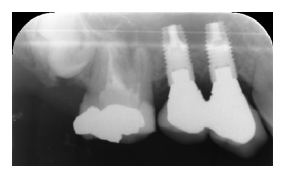
Fig. (6). Ray six months after prosthetic load. The bone surrounding the implants appears stable.

At present, the survival rate for AML with treatment is over 50% [19]; the patient reported herein is still considered free of pathology, 10 years after the last anti-neoplastic treatment. Furthermore, he has not shown any signs of recidivism in the last 18 years. Since more patients with AML are expected to live in adulthood, this case will assist in the future evaluation of AML survivors in terms of the long-term dental effects of anti-neoplastic treatment. It is also possible that the information provided by this case will be applicable to other juvenile cancer treatments, though future work is needed to assess this accurately. Moreover, it is not common to diagnose dental lesion related to pediatric treatment for leukemia, but it is possible that oral diagnosis is underestimated due to lack of knowledge.