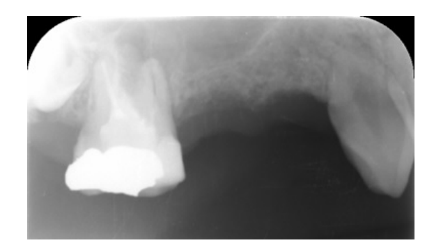
Fig. (2). Radiograph after tooth extraction and healing before dental implants.

Three months after dental extraction (Fig. 2), two screw-type implants (4 mm width and 10 mm length, Nobil Bio Ricerche S.r.l, Portacomaro (AT), Italy) with an etched and sandblasted surface were placed via a conventional submerged surgical technique [18], with a crestal sinus lifting and no bone graft (Fig. 3). Stitches were removed after 14 days and during healing, no adverse event occurred.