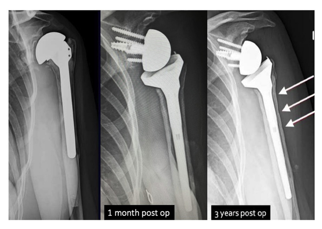
Figure 3 Radiographs preoperatively and at 1 month and 3 years postoperatively ( post op ) in suture cerclage case 3. This case required revision of a cemented humeral stem with a loose glenoid. An indolent infection was diagnosed based on preoperative aspirate with positive culture results for Cutibacterium acnes . The patient underwent 2-stage reconstruction, with an extended humeral osteotomy and cement spacer for 6 weeks, followed by reverse shoulder implantation and 6 cerclage sutures. The indentations of the proximal 3 sutures in the cortex ( arrow ) should be noted. The osteotomy healed, and the patient had no pain and no evidence of subsidence at 3 years postoperatively.

There are several limitations to this study. First, the number of patients is limited, and the series is retrospective in design. Second, the population is heterogeneous with multiple indications. Most important, no comparative group was included. However, we suggest that a comparison group was not required for this study. The intent was to establish suture cerclage as a safe alternative to other devices. In this study, no reoperations were performed and no failures were identified; therefore, any comparative group would be at best equal and possibly inferior if surgery was required for hardware pain or nonunion. It is not the intent of this study to suggest superiority to other fixation devices. We simply suggest this is a reasonable and safe alternative.