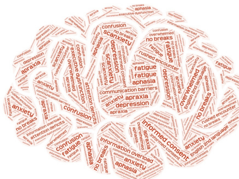
Figure 1. Word cloud of competing factors for neuro-oncology patients participating in cognition research.

A fundamental requirement of all research with human subjects is the assurance that informed consent has been obtained from all study participants. Informed consent, defined as the willingness to participate based on a complete understanding of the risks, benefits, and purpose of the research, is sometimes difficult to obtain [7]. Cognitive research for patients with glioma is subject to challenges stemming from two broad categories: (1) the neuro-oncology context of the study and the (2) communicative and cognitive impairments demonstrated by the patients. These two sources each provide their separate ethical dilemmas that merit broader discussion (Figure 1).