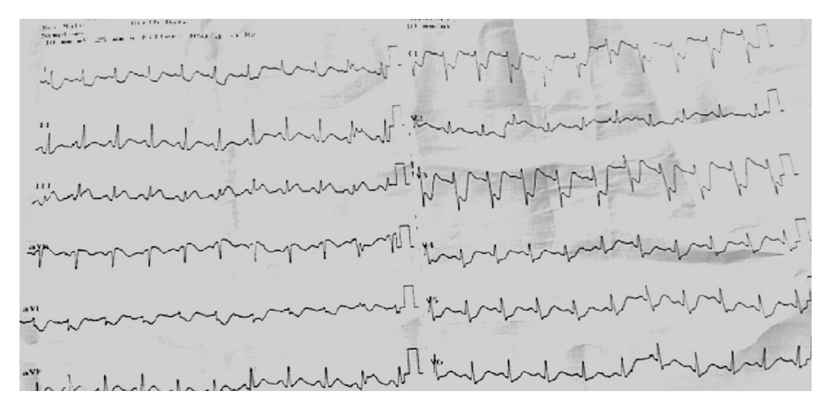
Fig. 1. ECG revealed ST elevation in inferior derivations and ST depression in anterior and lateral derivations.

and LDH levels were normal in laboratory. After O2 inhalation theraphy, intravenous antihistamine and prednisolone administrations, the patient was hemodynamically stabilized and serial ECG recordings showed regression of ST-elevations. Coronary angiography was performed and normal Left and Right Coronary in Coronary Angiography (Fig. 2) was detected. By this way the patient diagnosed as Type 1 Kounis Syndrome. The patient was followed in coronary intensive care unit and oral antihistaminic treatment continued. Patient whose follow-up and treatments were successfully completed was discharged.