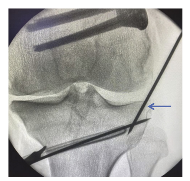
Fig 3. Perioperative radiograph showing 1 K-wire defining the osteotomy plan during high tibial osteotomy and the K-wire hinge protection ( arrow ).

Two K-wires are positioned to mark the upper border of the osteotomy, aiming for the tip of the fibular head on a true anteroposterior x-ray film.<sup>8</sup> The knee is held