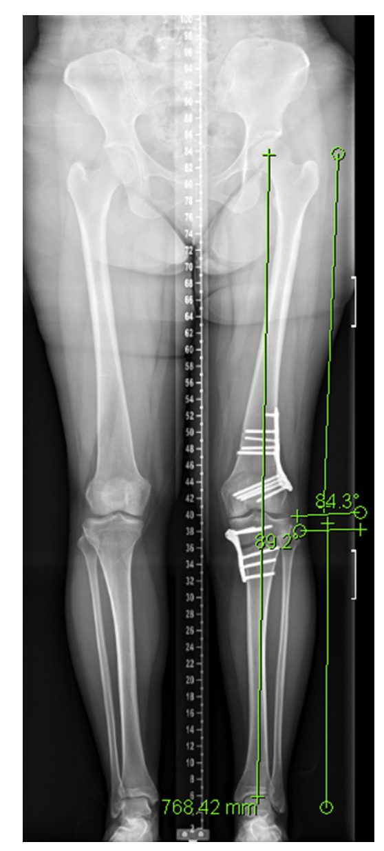
Fig 4. Postoperative radiographs at 6 months show neutral alignment with correction of mechanical lateral distal femoral angle and medial proximal tibial angles.

This cut now fixes the orientation of the blade and one K-wire is enough to guide it to the hinge. The cut, as mentioned, should be performed distal to the wire to avoid deviating towards the joint and is in biplanar fashion carried out in the posterior {}^{3}/_{4} of the tibia. During this process the posterior retractor remains in place, finding its way through the posterior surgical