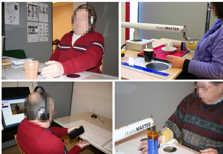
Figure 1 Picture of patients training in the control group (left) and in the experimental group (right).