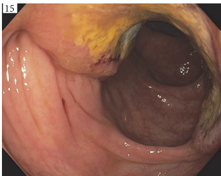
FIGURE 2: A large, friable, and infiltrative tumor which occupied 50 to 74% of the circumference of the ascending colon.

a large, friable, and infiltrative tumor which occupied 50 to 74% of the circumference of the ascending colon. It was not causing significant narrowing (Figure 2). The tumor bled on contact. Multiple cold forceps biopsies were taken. The specimens were collected for pathology. The tumor measured approximately 6 cm × 3 cm in size. Biopsy of right thigh mass was done. The cecum and rest of the colon appeared to be normal. An immune-peroxidase stain panel done showed CAM5.2 positive, 34 BE12 positive, CDX-2 positive, CEA positive, CK-7 negative, and CK-20 negative, TTF-1 negative consistent with adenocarcinoma of colon (Figure 3). A PET scan confirmed hypermetabolic activity only at ascending colon and in areas of cutaneous soft tissue masses. She was diagnosed to have stage 4 adenocarcinoma of the right colon with multiple cutaneous metastases and was started on combination chemotherapy with folinic acid, fluorouracil, and oxaliplatin (FOLFOX). Currently she is undergoing chemotherapy cycles.