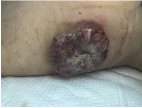
FIGURE 1: Cutaneous lesion in the lateral aspect of right thigh measuring 4 cm × 3 cm.