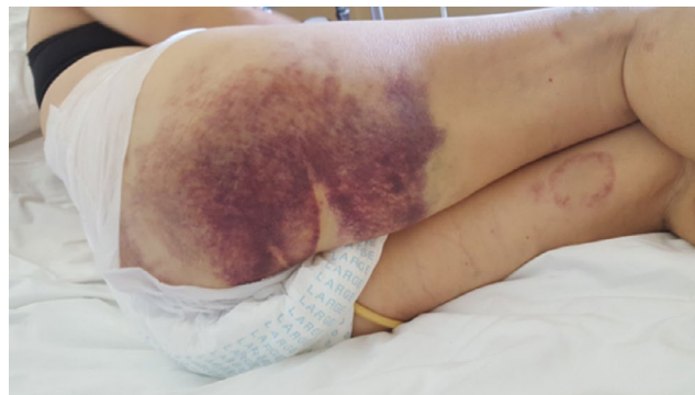
FIGURE 1 Clinical manifestation of bleeding symptoms (lower extremity subcutaneous hematoma) in a patient with acquired factor V inhibitors

Due to a lack of clinical response and coagulopathy correction with supportive therapy, a plasma-mixing study for both PT and aPTT was performed, demonstrating the absence