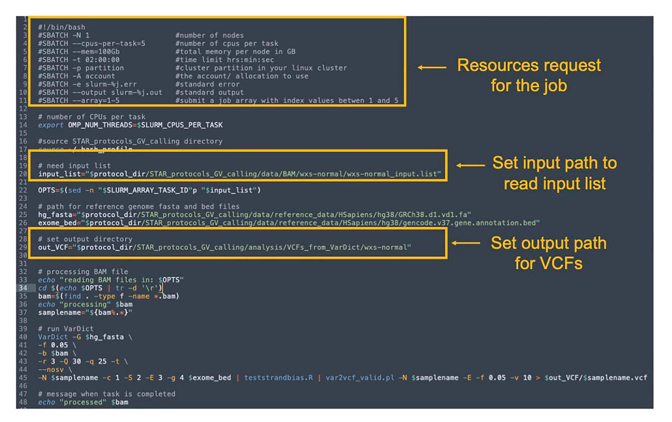
Figure 1. Example showing the structure of the VariantCallingFrom_VarDict.sh bash script

The highlighted text in yellow demonstrates resources requested for the job, where to set path to read input.list, and path to output VCF files. To open and edit bash script use any text editor like nano.