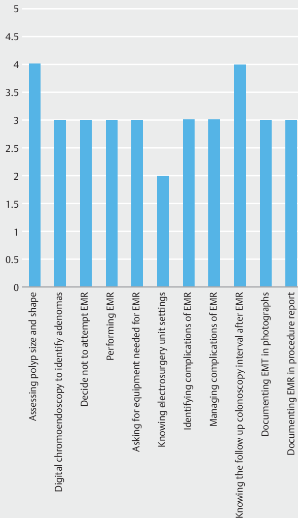
Fig. 2 Median confidence reported by fellows in individual steps of EMR of large colon polyps. Five-point scale rating: 1. I am not familiar with this topic; 2. Not confident at all e.g. attending does most of the assessment and procedure; 3. Somewhat confident e.g. attending takes the scope often; 4. Confident e.g. attending takes the scope in difficult scenarios; and 5. Very confident e.g. attending rarely takes the scope. EMR: Endoscopic mucosal resection.

tion in various aspects of colonoscopy, but may lack a structured curriculum for the performance of EMR. Further studies are warranted to evaluate the inclusion of EMR training in gastroenterology fellowship curriculum and the impact on knowledge base and clinical outcomes of polyp detection and complete resection.