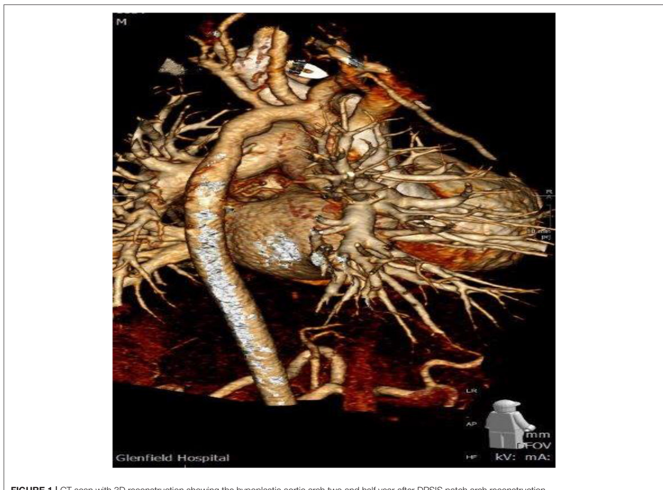
FIGURE 1 | CT scan with 3D reconstruction showing the hypoplastic aortic arch two and half year after DPSIS patch arch reconstruction.

the difference didn't reach statistical difference at the T -test (P = 0.12).