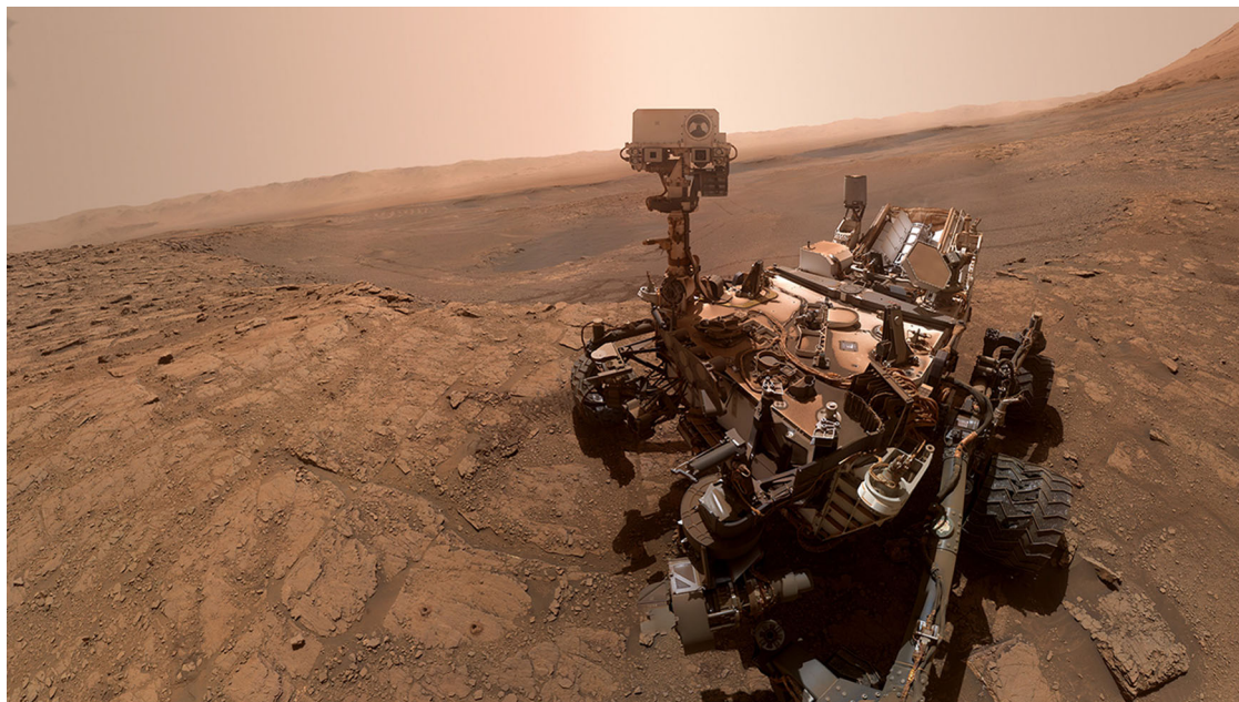
Fig. 2 Selfie of NASA's Curiosity rover, taken on Oct. 11, 2019. The geologic structure in the background is the northern rim of the Gale Crater. More advanced, self-aware rovers are necessary to provide future geologic information from the hostile surfaces of planetary bodies.

financial resources for after-mission science data exploitation, at least in the European sector. NASA, for example, foresees such funding possibilities. However, the European Space Agency, according to its charter, merely supports hardware developments, launch possibilities, spacecraft operations, and data archiving. Scientific exploitation of data collected is entirely up to European national science funding agencies. This very often leads to unhealthy situations. For instance, Rosetta, Europe's planetary flagship, finished operations in autumn 2016. After a data archiving phase, the mission was coming to an end in September 2017. However, much of the observations have not yet been analysed. The scientific mission is actually not finished. But very limited European wide coordinated effort has been initiated to secure the further exploitation of the data, due to a missing science exploitation plan. No private company would dare to invest 1.5 billion euros, and cutting the return-of-investment line that early. At least 2 percent of the overall mission investment should be reserved to coordinate the after mission operation science exploitation and analysis! Such funds should also be used to foster citizen science projects.