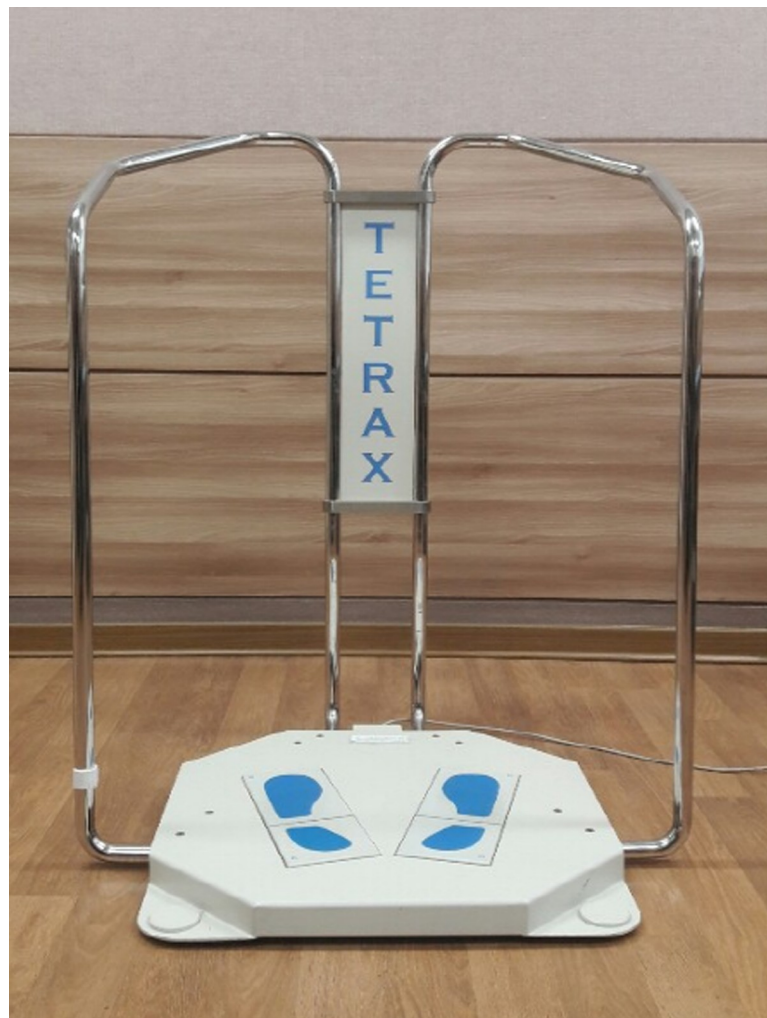
Fig 1. TETRAX® static posturography system used in this study.

In this study, postural evaluation was performed using the TETRAX® static posturography system (Tetrax Potable Multiple System, Tetrax Ltd., Ramat Gan, Israel) (Fig 1). The TETRAX biofeedback system is a device designed to assess the overall balance of the body, in which four