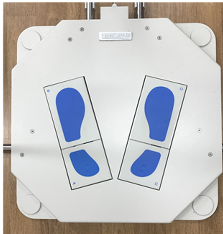
Fig 2. Four plates on the TETRAX® static posturography device.

The postural instability index is calculated based on the concept that the higher the stability, the less the change in the weight on the four force plates. Since the index represents the overall postural instability by measuring the degree of posture sway on the four force plates, the larger the posture instability index value, the more often or the higher the % change in the weight of the four force plates. Therefore, it may be estimated that the higher this index value, the more unstable the posture [25]. The postural instability index also increases with age as a result of degraded postural control ( 11.69 \pm 2.21 in normal young subjects and 24.84 \pm 6.07 in old subjects over 65 years old) [26]. A Fourier analysis is a mathematical representation of the wave-length signals of the body's vibrations in a horizontal plane created by a patient to maintain a vertical posture. The vibration intensity in each region is calculated by subdividing various frequency components included in the measured value when the body sway occurs on the force plates through a Fourier transformation of postural sway [27]. The sway power index is divided into four frequency domains, as follows, and the causes of the increased body sway can be analyzed for each sensory organ. At first, the low-frequency region is in the range of 0.01–0.1 Hz, which means that an abnormally increased value in this region is associated with visual