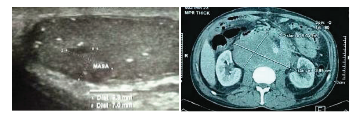
Figure 1. Imaging studies: (A) Ultrasound showing heterogeneous nodule and microcalcifications in the testicular parenchyma. (B) Tomography with retroperitoneal mass that encompasses large vessels.

In the testicle product of radical orchiectomy, macroscopically, all cases presented a whitish fibrous scar, located close to the to rete testis. The surrounding testicular parenchyma did not present significant alterations. For histological interpretation, we divide the testicles into two regions: the scar and the area adjacent to the scar (paracicatricial), whose characteristics are described in Figure 2 and shown in micrographs in Figure 3.