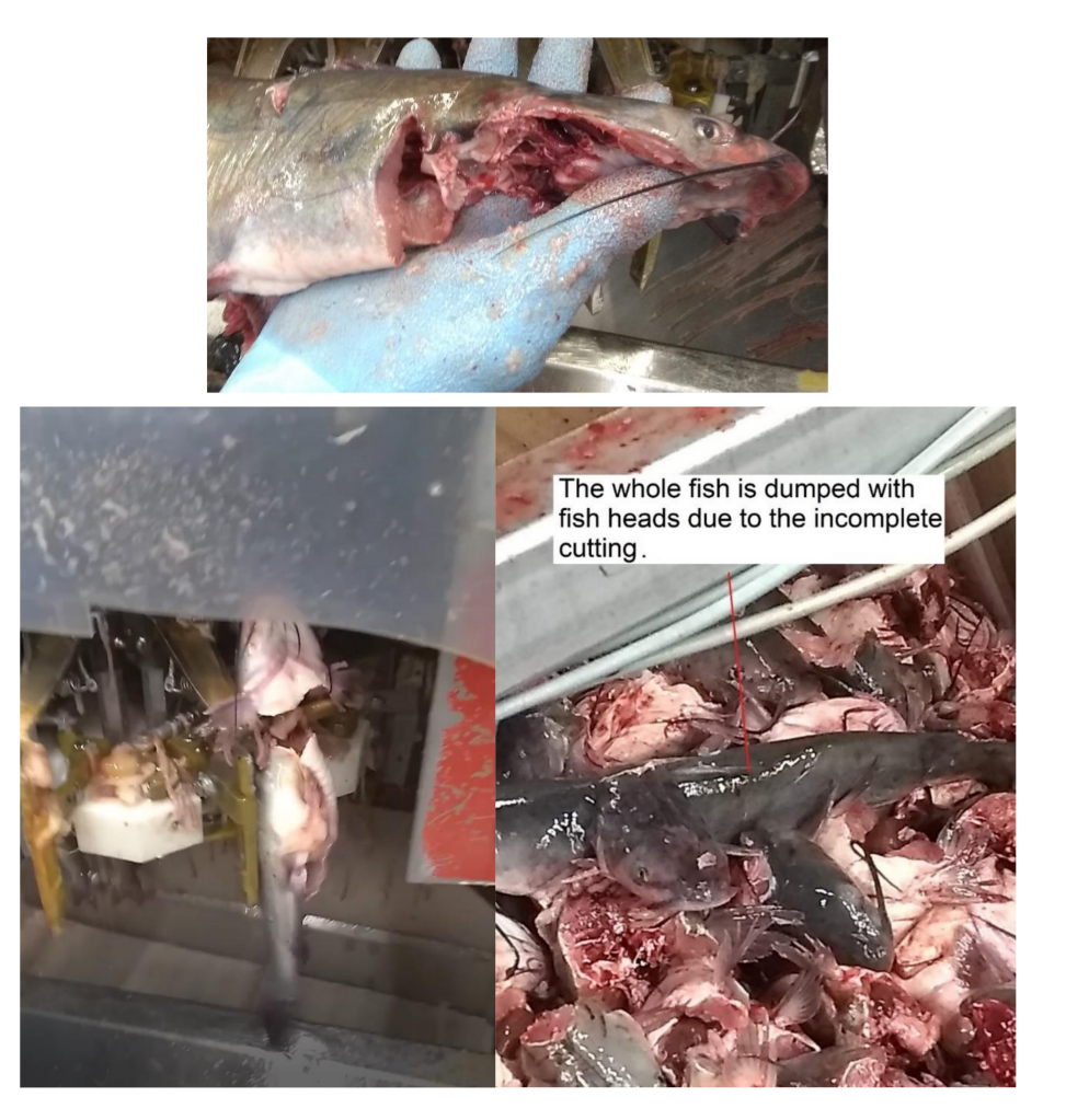
Figure 6. The waste due to deheading processes.