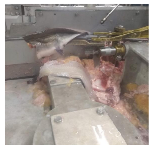
Figure 3. The filleting machine is frequently jammed because the fish guts are left in the machine. The normal filleting processing is affected by the jamming issue, which makes some fillets drop out of the machine as waste.