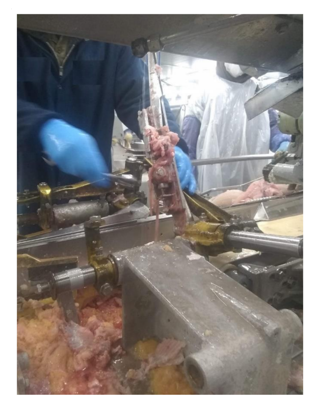
Figure 4. The manual cleaning process for the filleting machine.