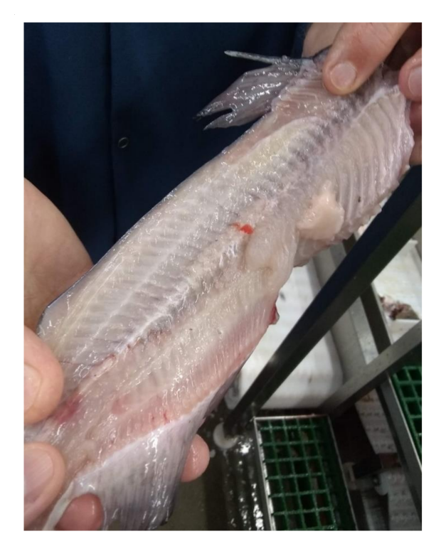
Figure 5. A fish rib bone from the filleting machine has a lot of fish meat left on it.